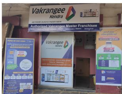
District : Balaghat State : Madhya Pradesh