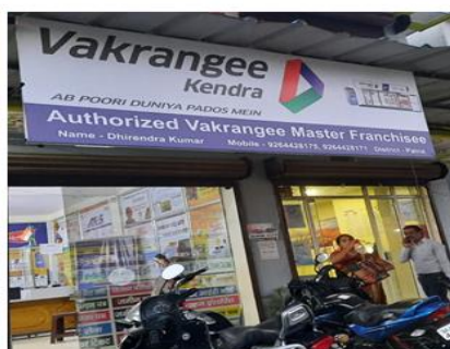
District : Patna State : Bihar