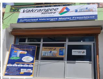
District : Pithoragarh State : Uttarakhand